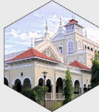
Agakhan Palace, Pune