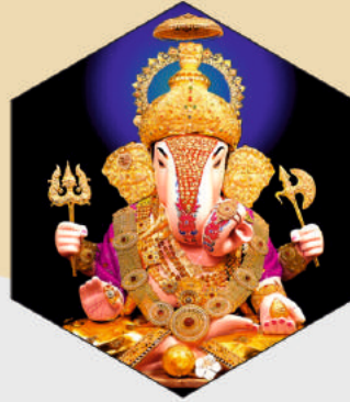
Dagdusheth Halwai Ganapati, Pune