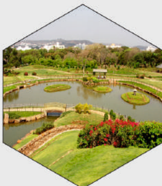
Japanese Garden, Pune