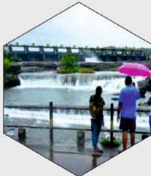
Khadakwasla Dam, Pune