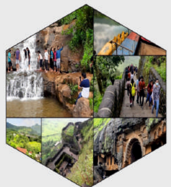
Lonawala and Khandala