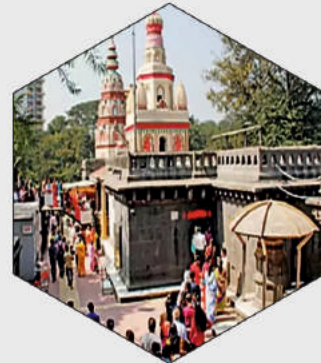
Moraya Gosavi Ganapati Mandir, Chinchwad