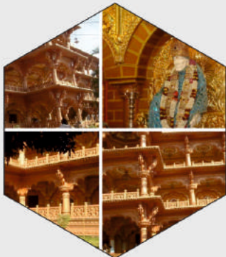
Prati Shirdi Saibaba Mandir, Shirgaon Pune