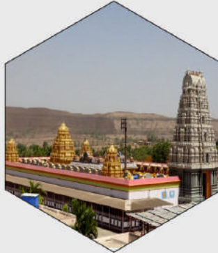
Sri Balaji Mandir, Narayanpur