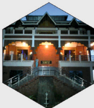
Iskon Govinddham, Akurdi